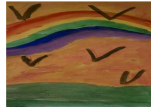
By Alaska Lilloock

own. We will also be starting our workbooks soon to learn about color theory.