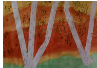
By Emma Perez

The second grade students are working on a birch tree painting, in which they used a technique called “making tape resist.” They did such a beautiful job with this project. It took three art days to complete, and each day we completed a different part of the project. In our next lesson, we will be learning about the stained glass art work of Louis Comfort Tiffany. We will be making our own faux-stained glass pieces using a variety of art materials. This is a messy, quick and very fun activity! ☺